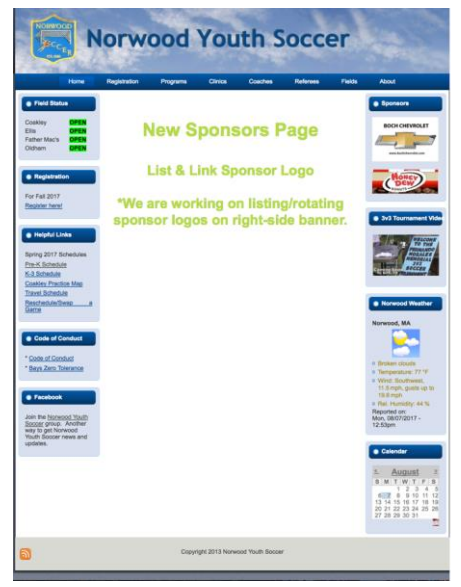
Example - Actual Website May Vary

The league website (www.norwoodsoccer.com) will list your logo and link to your company website.